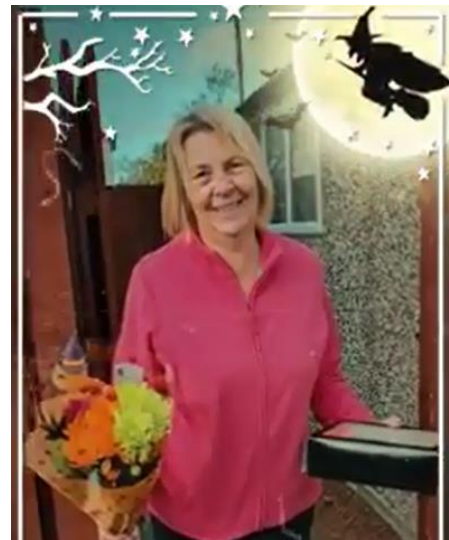
Dinnae ken her! Somebody new?