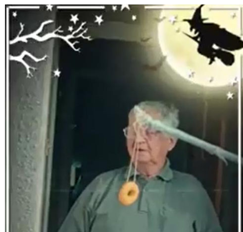
Ah! If ever a man could eat donuts....