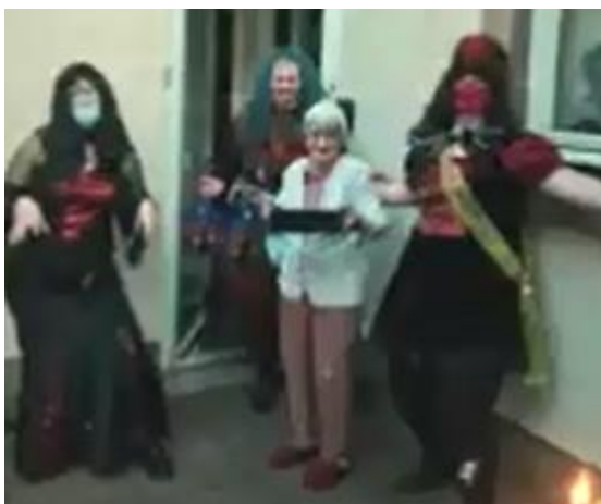
Rose being attacked by the Ghoulies