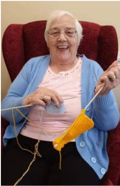
More natter than knitter