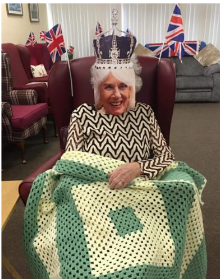
Nice to see Queen Camilla in the centre Volunteers Week