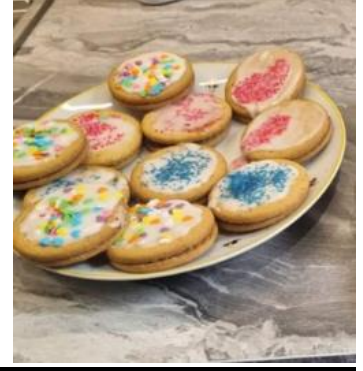
Mary Berry – eat your heart out