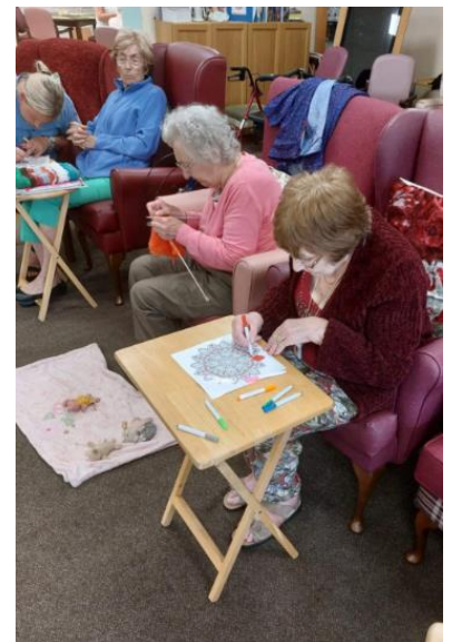
Busy Busy Ladies