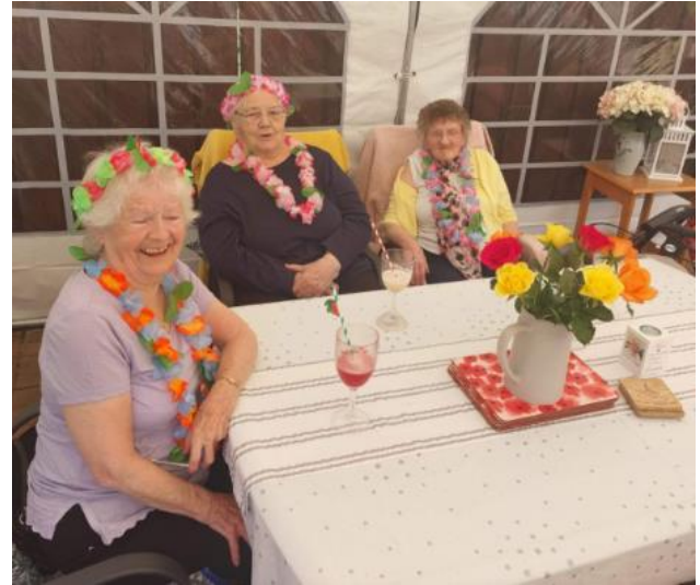
Cocktail Hour Ladies?