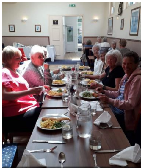
Green Tree Peebles