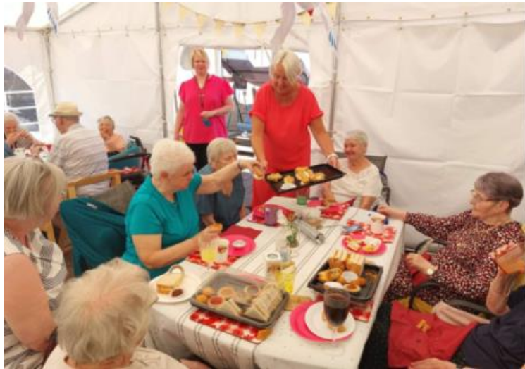
High Tea in the Bistro

The weather is continuing to look good in September and October so we will be trying to ensure everyone gets a visit to Funland (fee’s bistro)