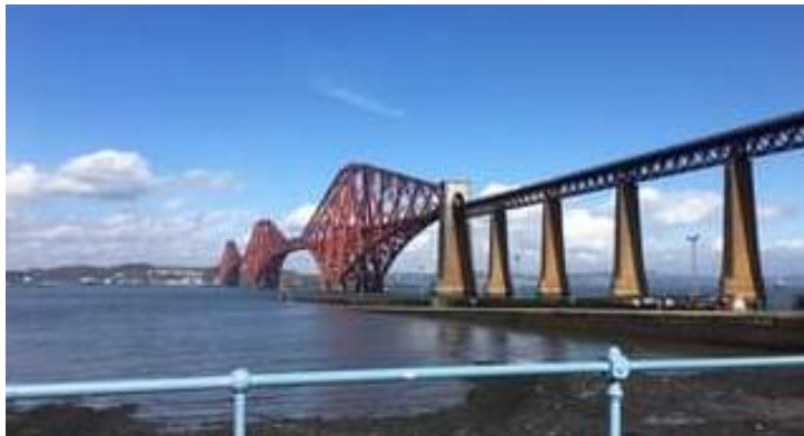
Ladies who Lunch