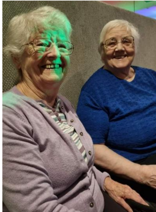
Looks like Phyllis put something in Margaret's drink