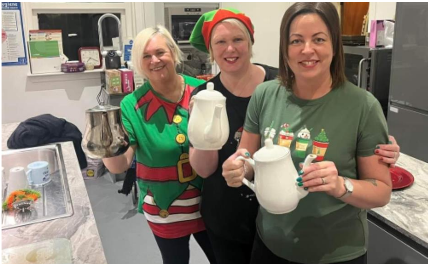
It makes a change seeing these three with tea in their hands