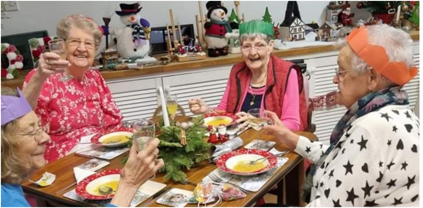
Ladies who Lunch