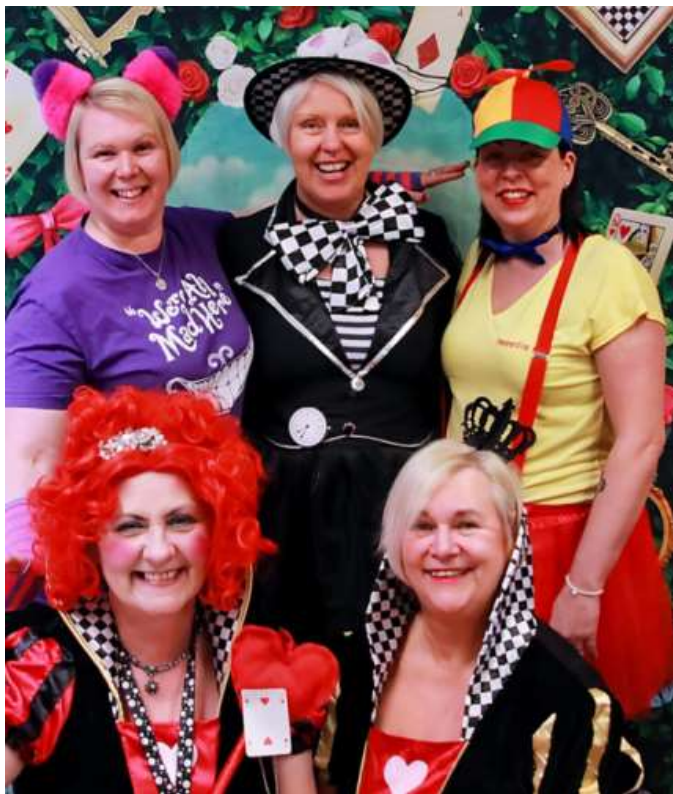
Don't ask me – I've no idea