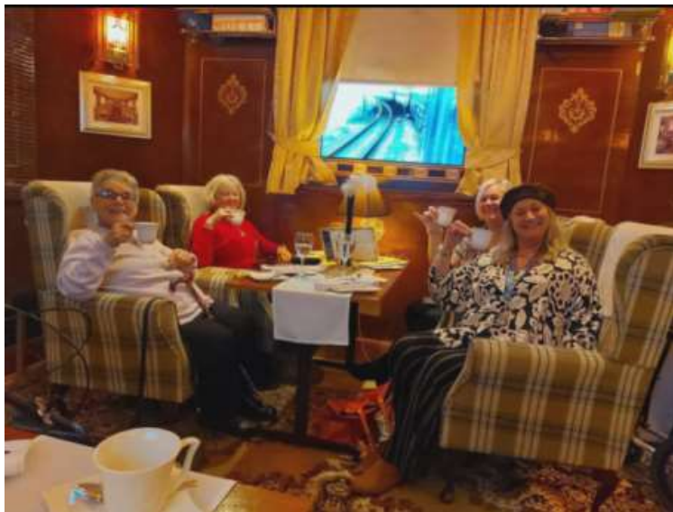
Ladies who lunch on the Orient Express