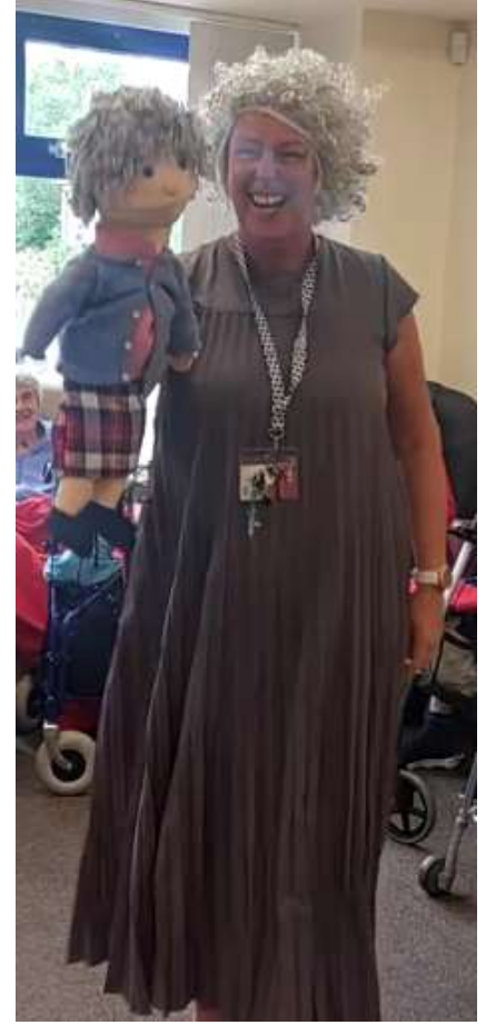
Staff at our Italian branch