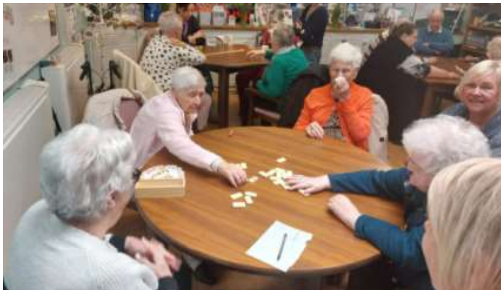
Too many hands on that table (and the referee is looking at the camera)