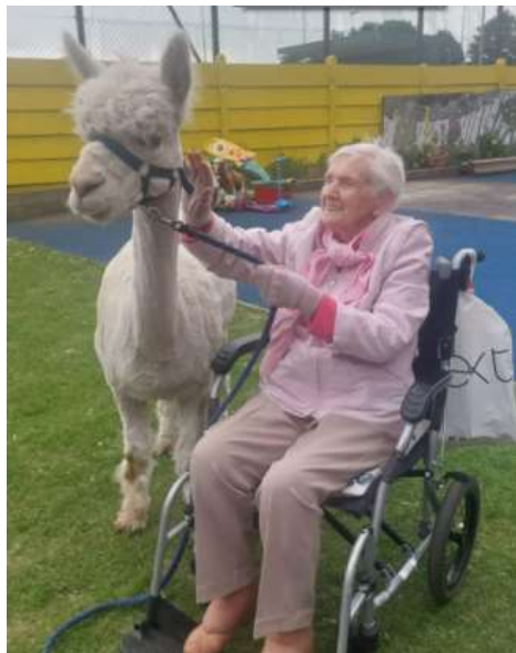
I'm sure that Beastie is Fear t' o' Bebe