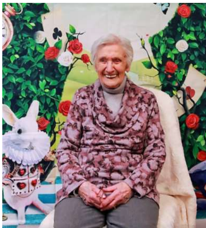
The Smiling Assassin